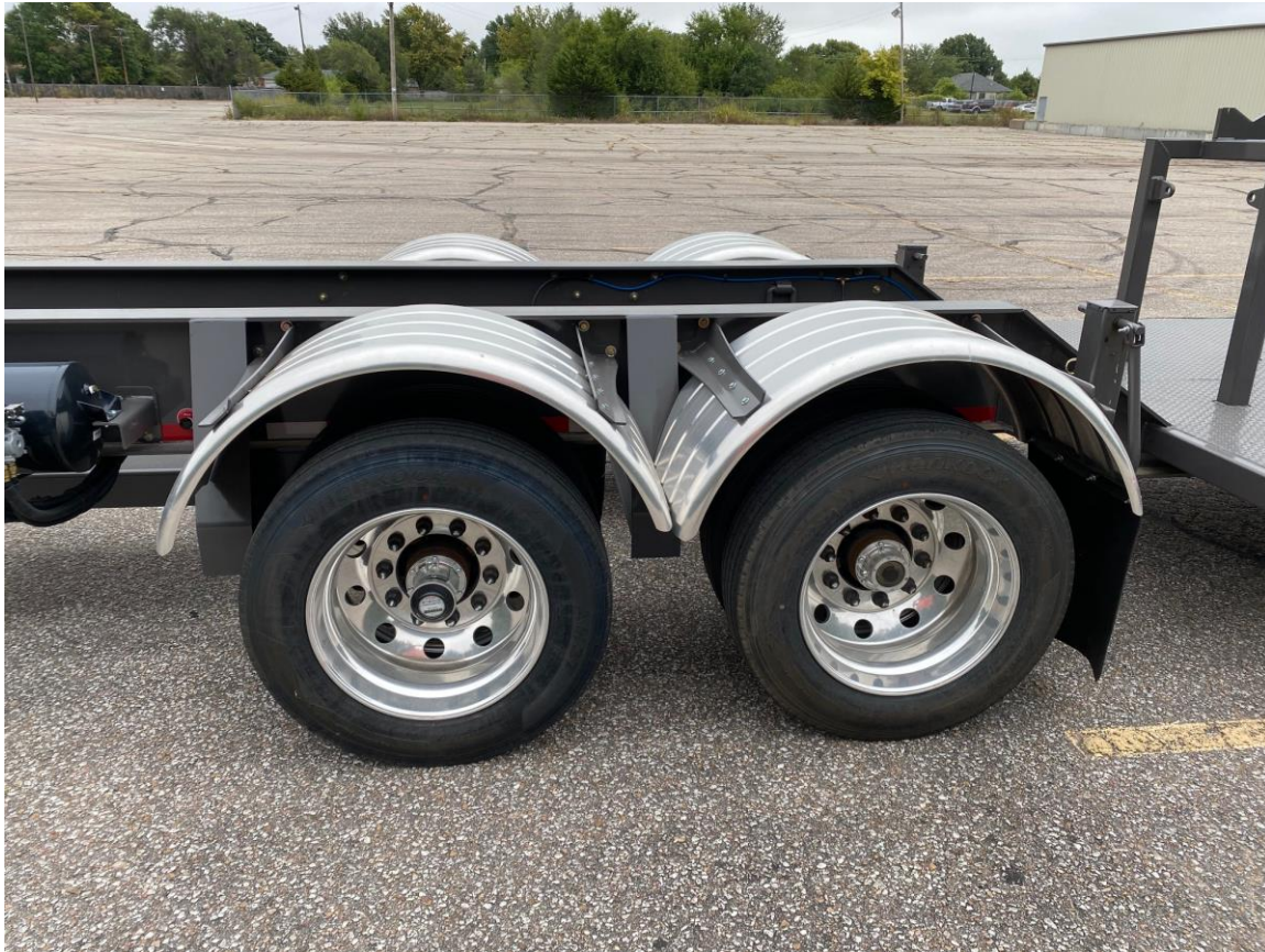
Full fenders and Flaps standard equipment 22.5" Chrome wheels standard also.

Air suspension standard Quick drop valve makes it easy to lower trailer when mounting boom to the machine